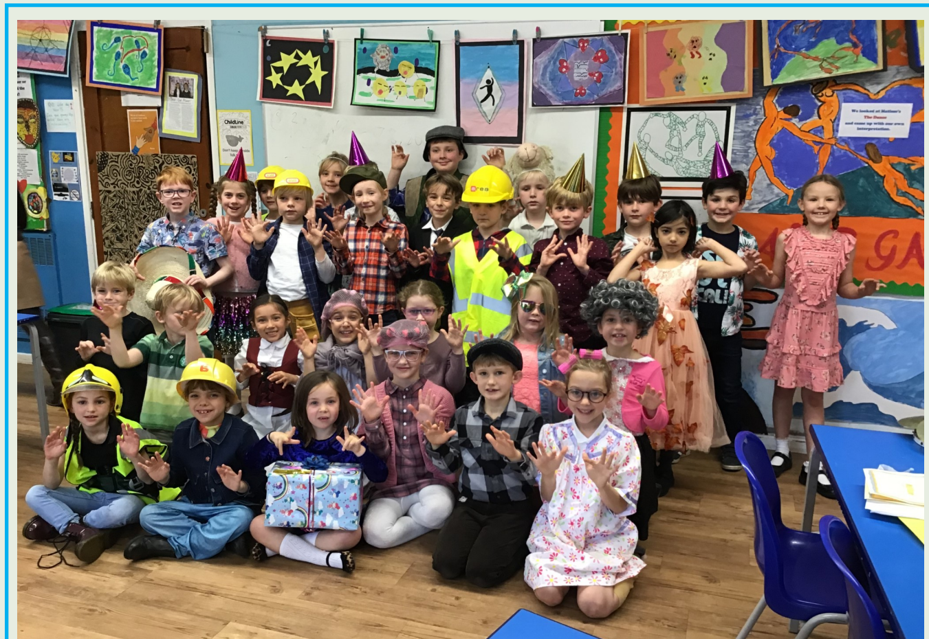
Year 1 and Year 3 wowed us with a show fit for the West End this morning, performing their Harvest Festival Assembly.