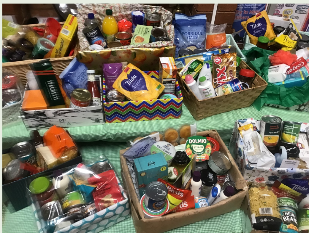
Some of the fantastic donations of harvest festival boxes